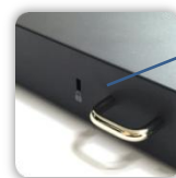
Kensington Lock & U-bar Lock